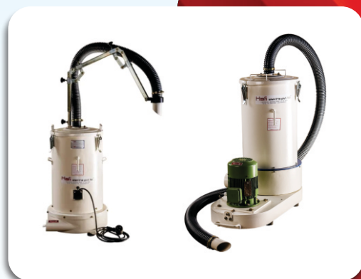
MOC : MS Powder Coated/ SS-304 / SS-316 / Contact Parts in SS Product Range Available from the Models 0.5 hp to 5 hp