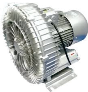
SIDE CHANNEL BLOWERS Range 0.5 hp and above