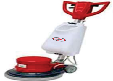
SINGLE DISC SCRUBBER Ideal for Tile Polishing