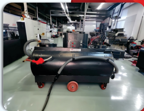
MOC : MS Powder Coated Product Range available from the Models 3 hp & 5 hp Three & Single Phase