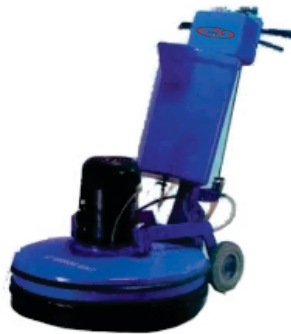
TRIOSCRUB JR & SR Ideal for Oily / Trimix Surface