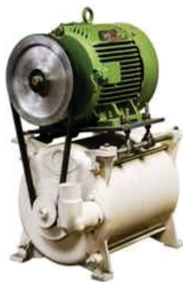
MULTI STAGE TURBINES Range 2 hp to 10 hp