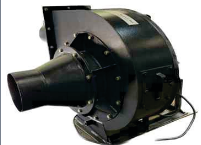
CENTRIFUGAL BLOWERS Range 0.75 hp and above