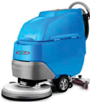
AUTOMATIC SCRUBBER DRYER Ideal for Epoxy / Tiles floor