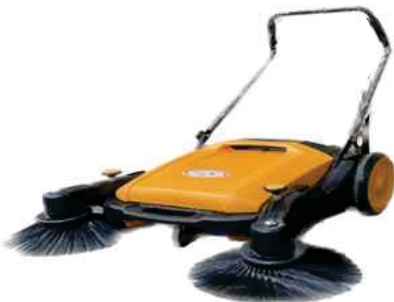
MANUAL SWEEPER Ideal for Indoor / Out Door Cleaning