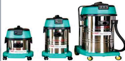
WET & DRY VACUUM CLEANERS Ideal for General / Smaller area Cleaning