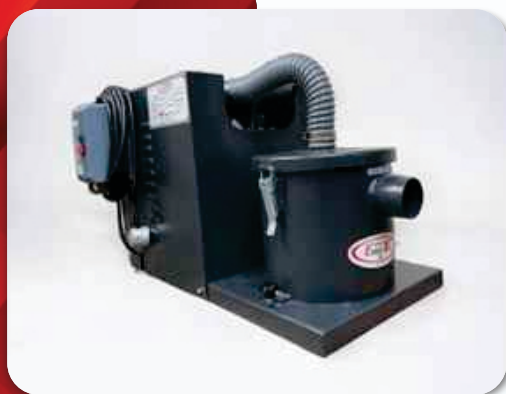
MOC : MS Powder Coated/ SS-304 / SS-316 Product Range available from Models 0.5 hp to 3 hp